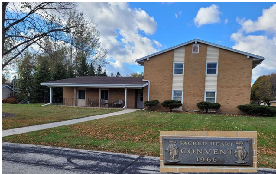
Victory center building, was a CONVENT in 1966

This new site is a 3-story building. Carpeted throughout. NO Elevators. Exhibitors and dogs must be able to use stairs. Stairs to the container element are NOT carpeted. Stairs to the interior element are carpeted.