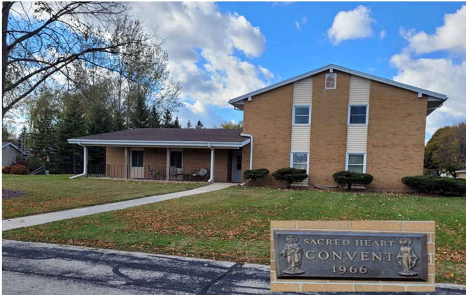
Victory center building, was a CONVENT in 1966

This new site is a 3-story building. Carpeted throughout. NO Elevators. Exhibitors and dogs must be able to use stairs. Stairs to the container element are NOT carpeted. Stairs to the interior element are carpeted.