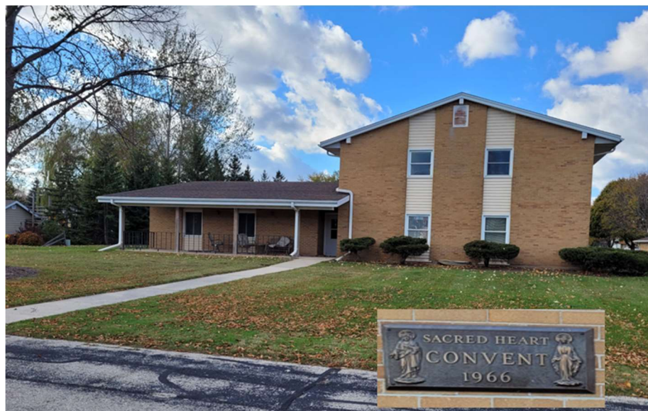
Victory center building, was a CONVENT in 1966

This new site is a 3-story building. Carpeted throughout. NO Elevators. Exhibitors and dogs must be able to use stairs. Stairs to the container element are NOT carpeted. Stairs to the interior element are carpeted.