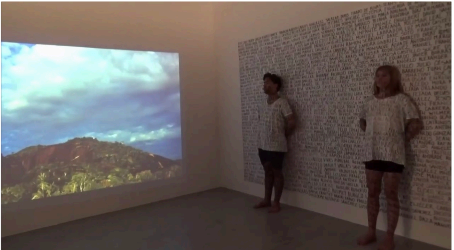
Venezuela: Land of Contrasts