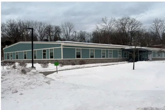
The proposed methadone dosing clinic in Hudson would be in the Twin Counties Recovery Services outpatient building on Power Avenue, pictured.