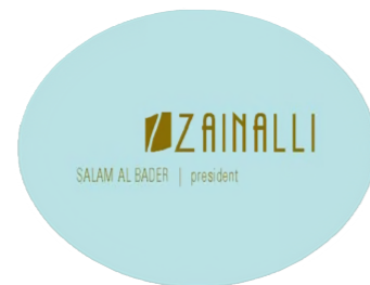
Zainalli Fine Fashion Corp.