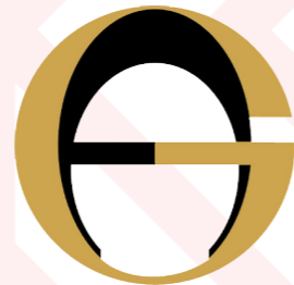
Albader Trading Group Corp.