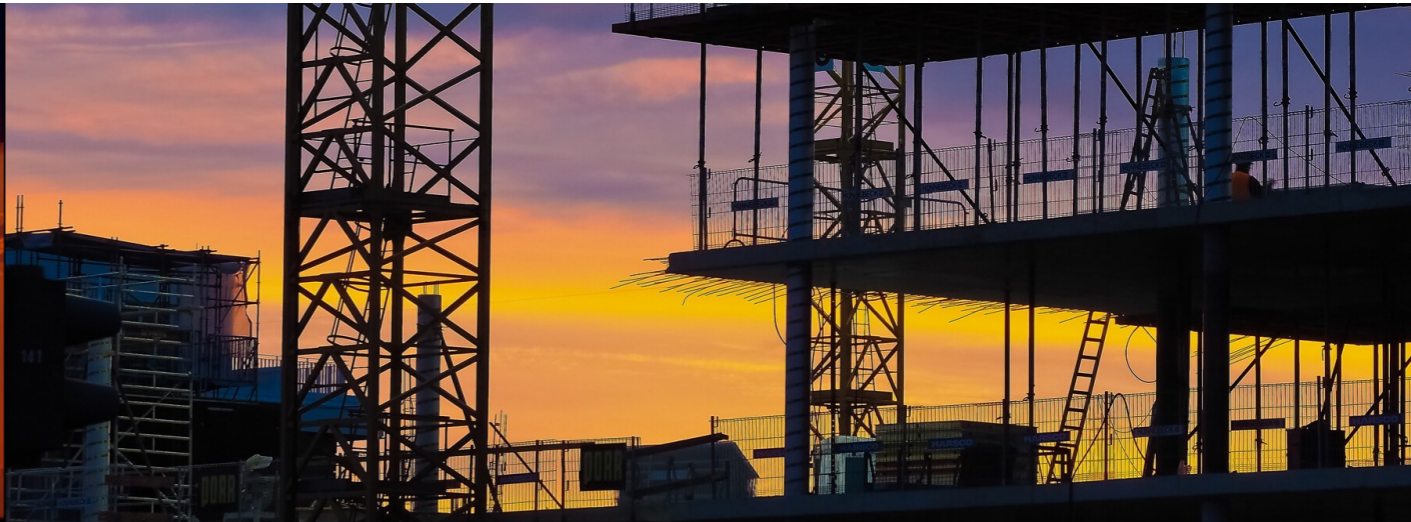
Construction & Development