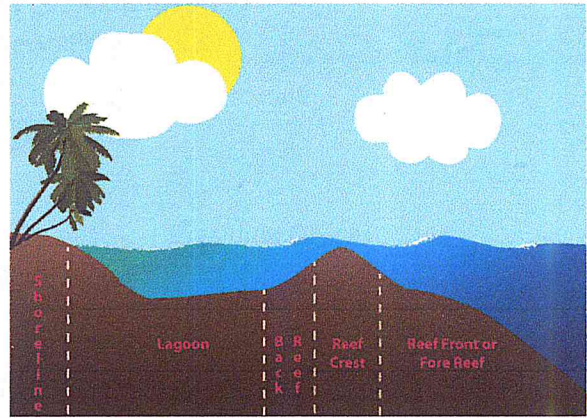
Figure 1. Cross-section of reef showing reef crest and fore reef.

4.4 'Wake' refers to the waves created behind a vessel as it travels through the water.