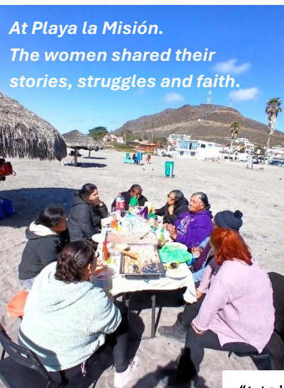
At Playa la Misión. The women shared their stories, struggles and faith.

... I want to highlight some key moments from our week, particularly our trip to Playa la Misión near Ensenada. We had an incredible experience with a committed group of women, many of whom rarely get the chance to go out. One participant had never left Tijuana, never even visited Rosarito, so it was profoundly rewarding to witness their joy despite their ongoing challenges with health, finances, and aging.