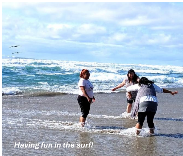
Having fun in the surf!