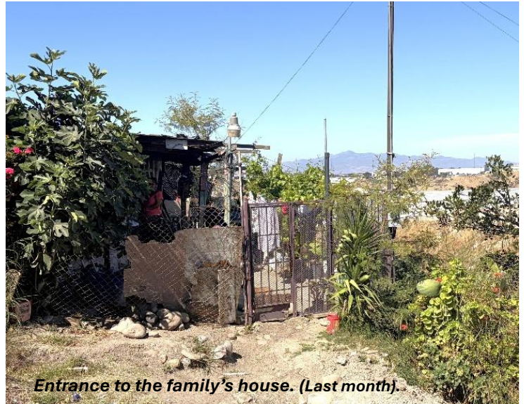
Entrance to the family's house. (Last month).