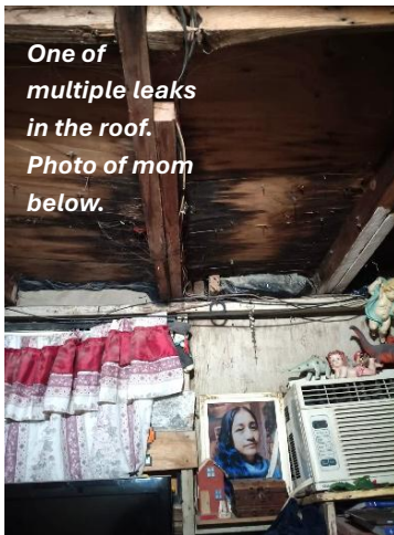
One of multiple leaks in the roof. Photo of mom below.