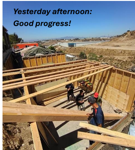
Yesterday afternoon: Good progress!