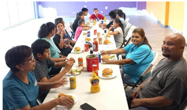
Left: Hamburgers are a favorite with the kids and staff at Simnsa Children's Home also! Each month our team prepares a meal and a Bible lesson to share.