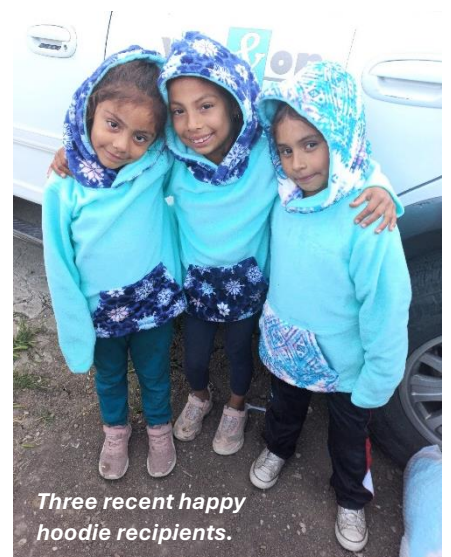
Three recent happy hoodie recipients.

How good and pleasant it is when God's people live together in unity! Psalm 133:1