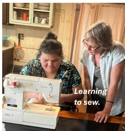
Learning to sew.