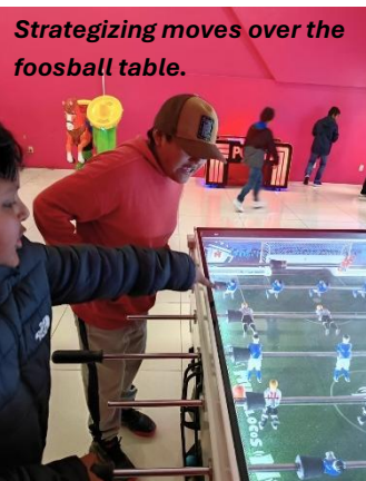
Strategizing moves over the foosball table.