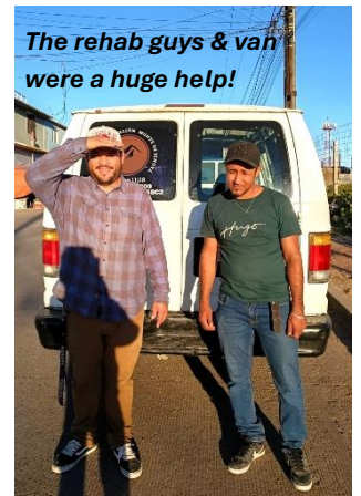
The rehab guys & van were a huge help!