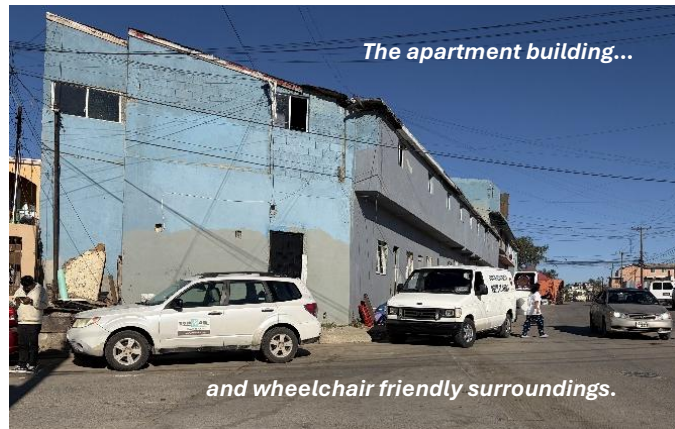
The apartment building...