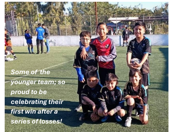
Some of the younger team; so proud to be celebrating their first win after a series of losses!