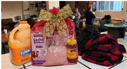
Each hamper contains a bag of rice, a jar of traditional Mexican molé sauce, a frozen chicken, a carton of milk, a box of cookies and a gallon of fruit juice.

Each year much preparation goes into finding affordable, quality items to include in our food hampers for 150–200 families. The team once again did a great job of finding bargains and discounts and also worked on making bags to contain the items. The end result was quite impressive, each hamper containing enough to provide a meal for an average size family for around $25.