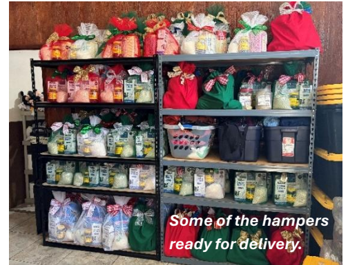
Some of the hampers ready for delivery.