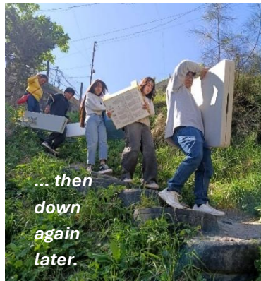
... then down again later.