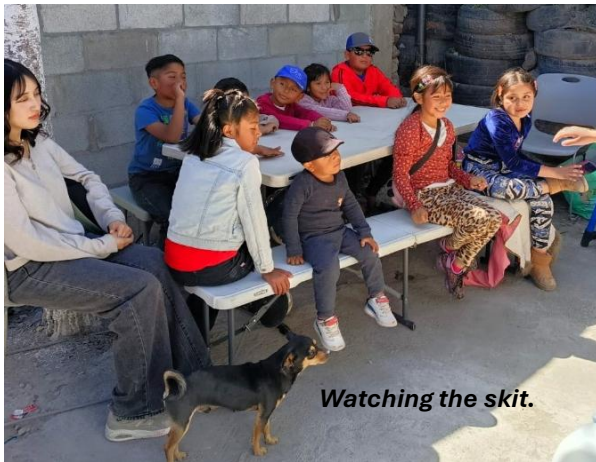
Watching the skit.

About 25 kids and some of their parents enjoyed hearing a message about trusting in God's unconditional love.