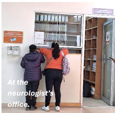
At the neurologist's office.