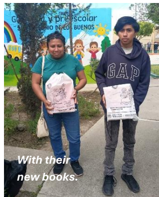
With their new books.