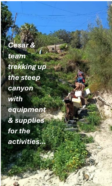
Cesar & team trekking up the steep canyon with equipment & supplies for the activities...

WORKING IN LA INVACION... Valentine's Day activities last month opened up more opportunities to work with some of the families living on the canyon slopes of Leandro del Valle, home to many who end up there when they have nowhere else to go. Referred to as "Invasions" in Tijuana, shanty homes dot slopes on vacant, unusable land. For some the homes are temporary, for others permanent, unless/until they're moved on by authorities, or in some cases landslides. La Invacion in Leandro del Valle is one of many "invasions" in the city. This month we were able to present skits and activities for the kids in Leandro del Valle, thanks to a kind couple who opened their home to allow us the space to do so.