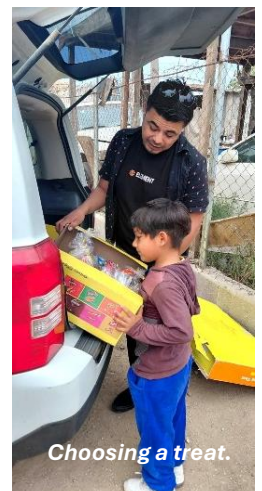
Choosing a treat.

Thank you for every candy that brought a smile, for every interaction that filled their day with life and for every word that touched their hearts. Today they not only left happy, but they also left feeling seen, loved and remembering that God is always with them. May God bless your lives and multiply everything you do, because what you sowed today in these young hearts, may bear fruit forever.