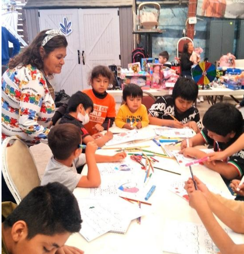
Each of the kids also received a gift.