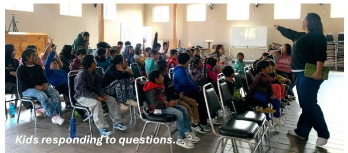
Kids responding to questions.

The kids at Refugio de Amor heard how Joseph, from an early age, trusted God's promises, enabling him to overcome great adversity and rise to become a great leader of his nation.