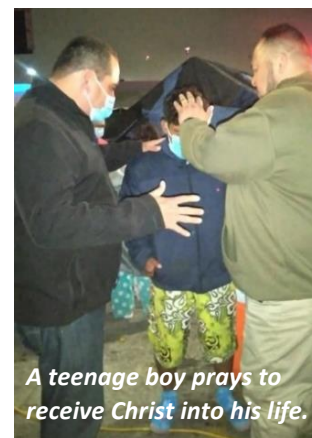
A teenage boy prays to receive Christ into his life.