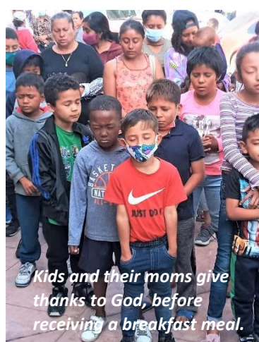
Kids and their moms give thanks to God, before receiving a breakfast meal.