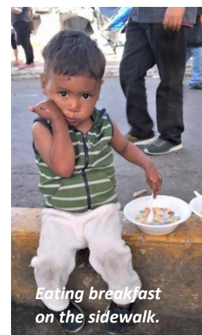
Eating breakfast on the sidewalk.