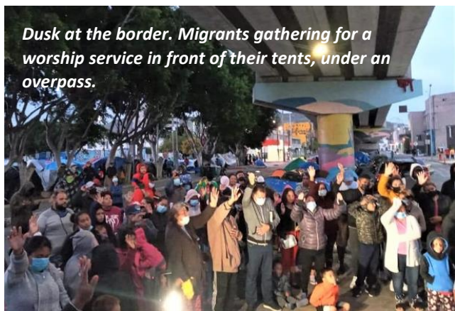
Dusk at the border. Migrants gathering for a worship service in front of their tents, under an overpass.

But our citizenship is in heaven, and from it we await a Savior, the Lord Jesus Christ, Philipians. 3:20