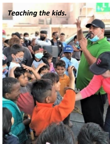
Teaching the kids.