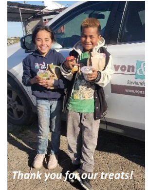
Thank you for our treats!