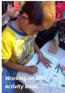
Working on his activity book.

Along with the Good News message, kids in our barrios enjoyed celebrating with food, fun, games, and some special T-shirts, (thanks to Iglesia Obrera, Tijuana!)