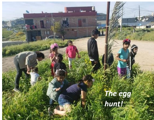
The egg hunt!