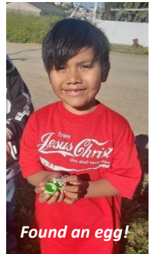
Found an egg!

Along with the Good News message, kids in our barrios enjoyed celebrating with food, fun, games, and some special T-shirts, (thanks to Iglesia Obrera, Tijuana!)