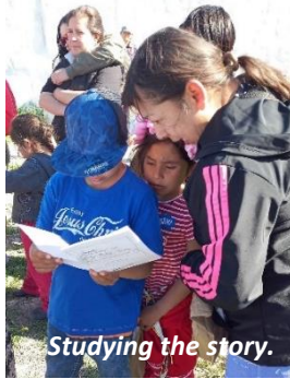
Studying the story.