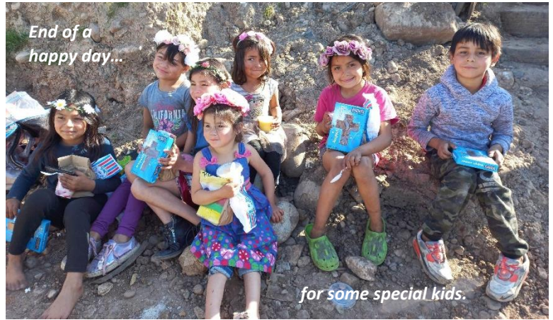
End of a happy day...