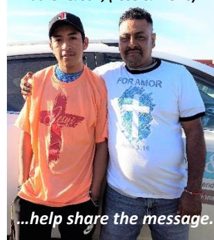
...help share the message.