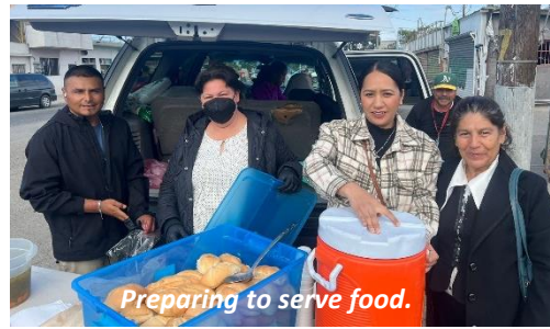
Preparing to serve food.