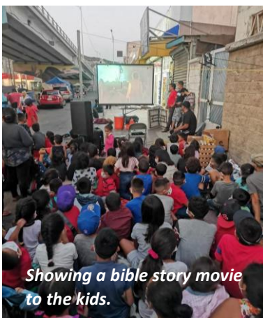
Showing a bible story movie to the kids.