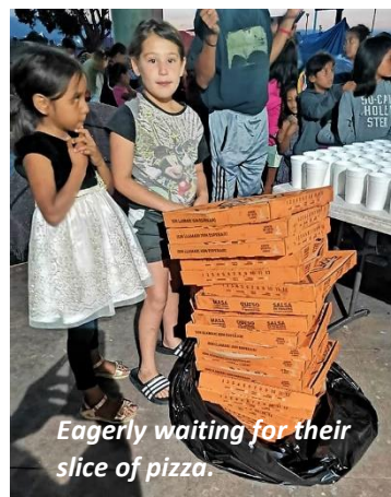
Eagerly waiting for their slice of pizza.