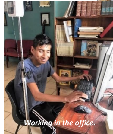
Working in the office.