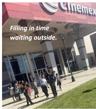
Filling in time waiting outside.