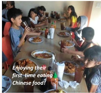
Enjoying their first time eating Chinese food!