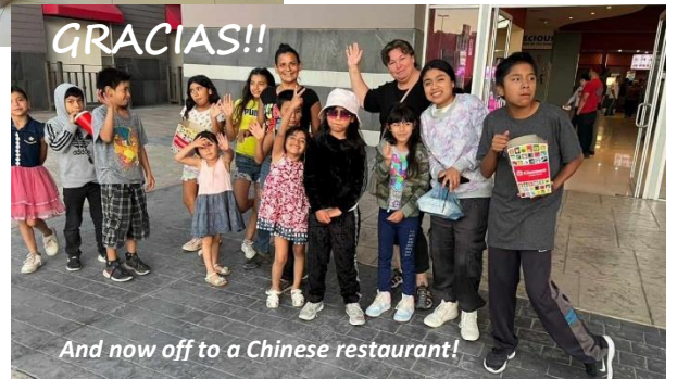
And now off to a Chinese restaurant!

You who are young, be happy while you are young, and let your heart give you joy in the days of your youth. Eccl. 11:9