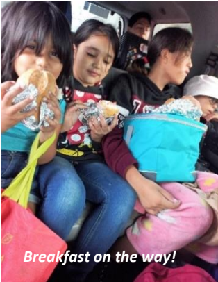
Breakfast on the way!

For most of the families in the areas we serve, the term “taking a vacation” is a foreign concept. Many kids spend their childhoods rarely venturing out of their immediate neighborhoods even during summer breaks. This month with school still out and dedicated funds available, we had the opportunity and privilege to take some special and well deserving kids on a few fun day trips. Simple fun met with excited anticipation!