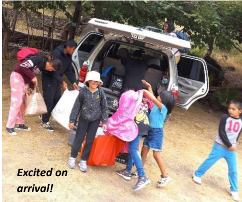
Excited on arrival!