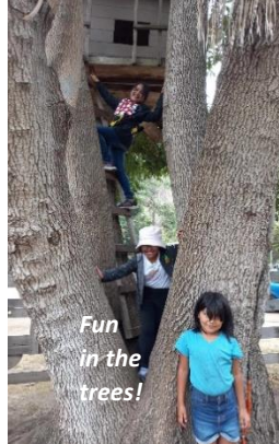
Fun in the trees!