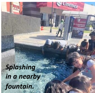
Splashing in a nearby fountain.