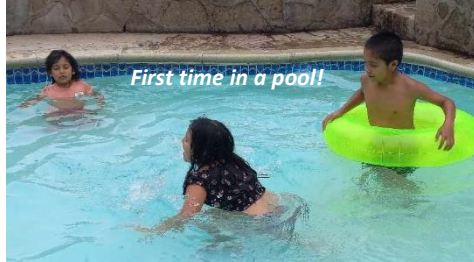
First time in a pool!