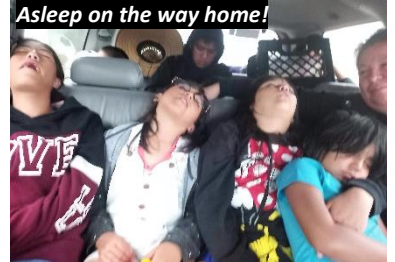
Asleep on the way home!