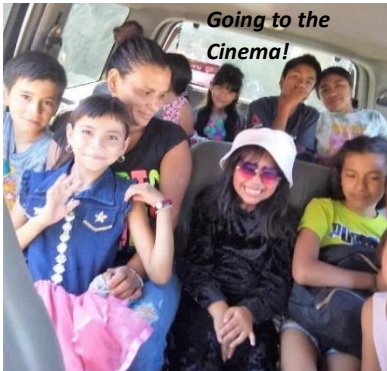
Going to the Cinema!