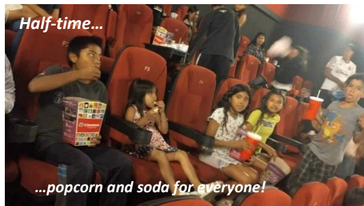
Half-time... ...popcorn and soda for everyone!