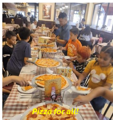
Pizza for all!