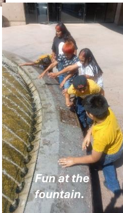
Fun at the fountain.