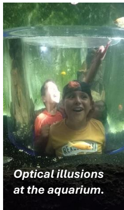
Optical illusions at the aquarium.