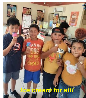
Ice cream for all!