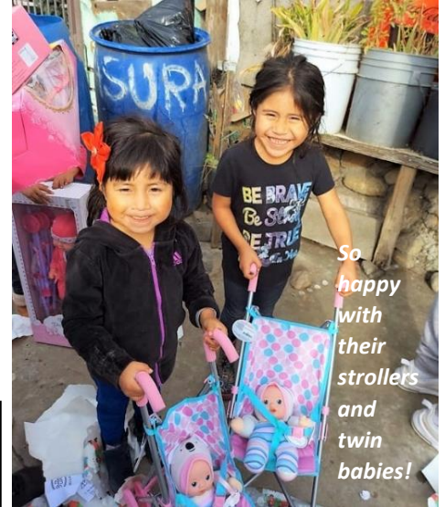
So happy with their strollers and twin babies!