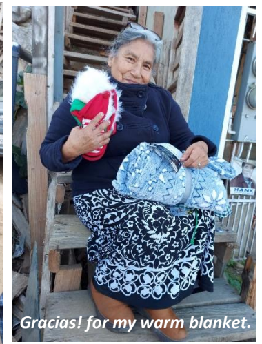
Gracias! for my warm blanket.