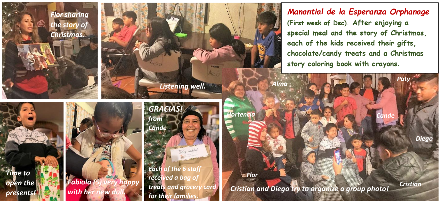
Manantial de la Esperanza Orphanage (First week of Dec). After enjoying a special meal and the story of Christmas, each of the kids received their gifts, chocolate/candy treats and a Christmas story coloring book with crayons.

Once again, we can't express our thanks to you enough for making it all possible!