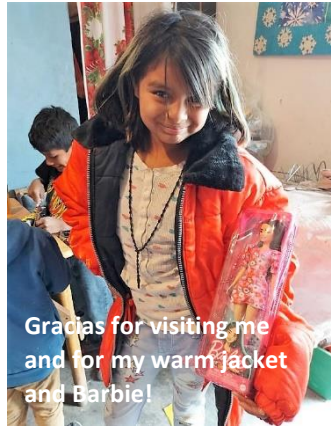
Gracias for visiting me and for my warm jacket and Barbie!