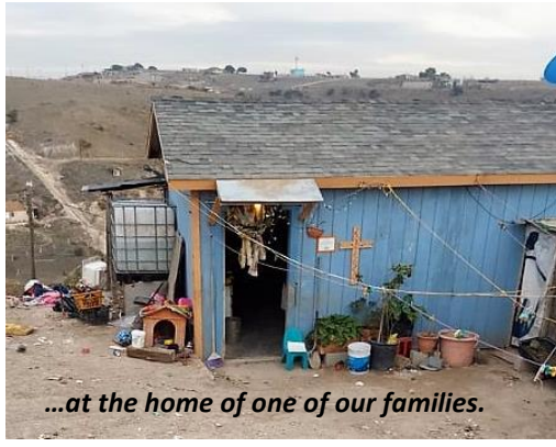
...at the home of one of our families.