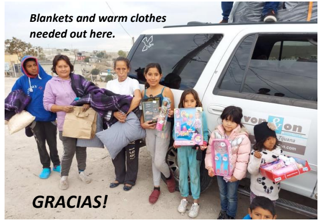
Blankets and warm clothes needed out here.