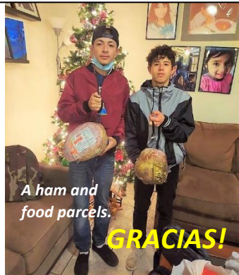
A ham and food parcels.