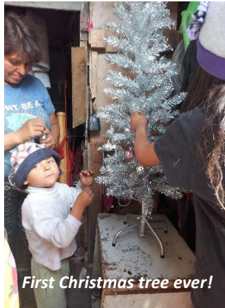
First Christmas tree ever!