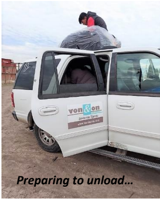
Preparing to unload...