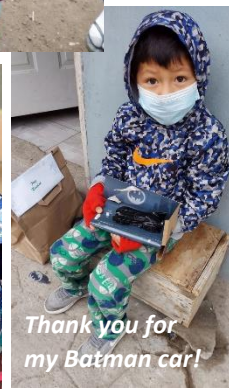
Thank you for my Batman car!