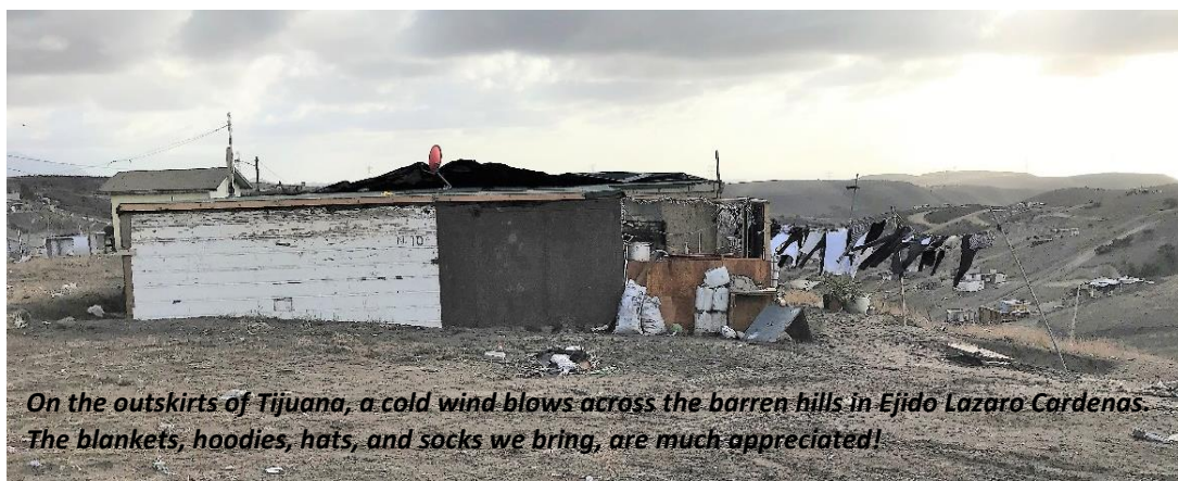
On the outskirts of Tijuana, a cold wind blows across the barren hills in Ejido Lazaro Cardenas. The blankets, hoodies, hats, and socks we bring, are much appreciated!