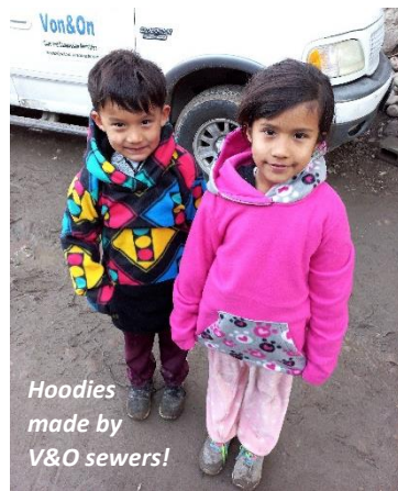
Hoodies made by V&O sewers!