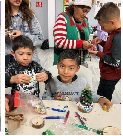
...one of our first steps. The kids and staff enjoyed a hot meal, (provided by V&O), a Christmas devotional time, a fun craft activity and gifts for all.