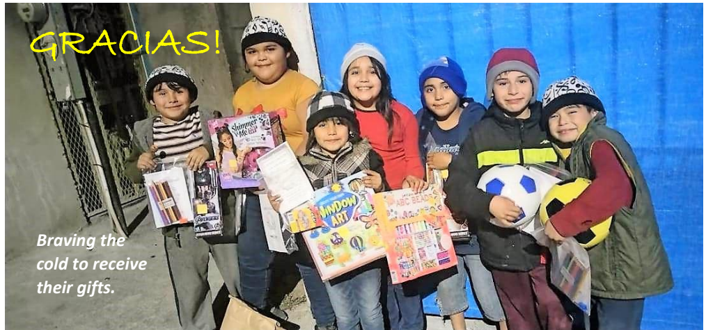
Braving the cold to receive their gifts.