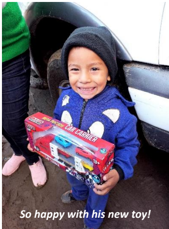
So happy with his new toy!