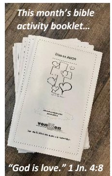
This month's bible activity booklet...