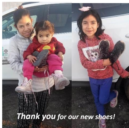
Thank you for our new shoes!