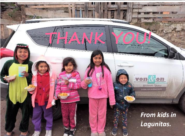
From kids in Lagunitas.

As Spring approaches, we hope to resume more of our outdoor activities/events with the kids in our communities. The opportunities to show and share God's love for them in word and in practical actions make them so worthwhile.