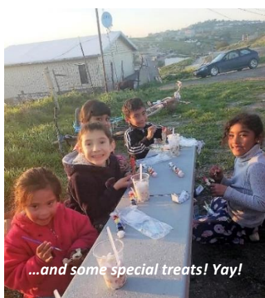
...and some special treats! Yay!