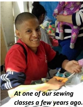
At one of our sewing classes a few years ago.