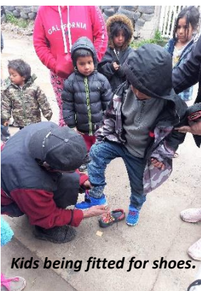
Kids being fitted for shoes.