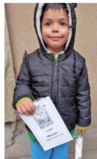
A finished craft.