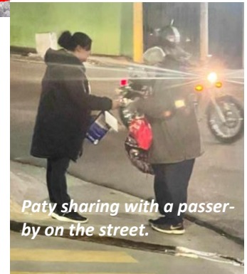
Paty sharing with a passer-by on the street.