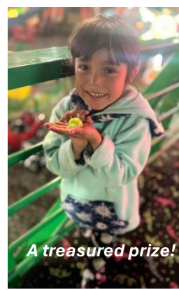
A treasured prize!