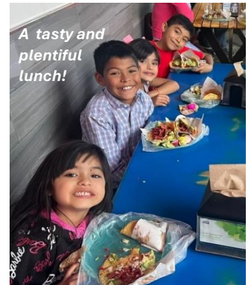
A tasty and plentiful lunch!