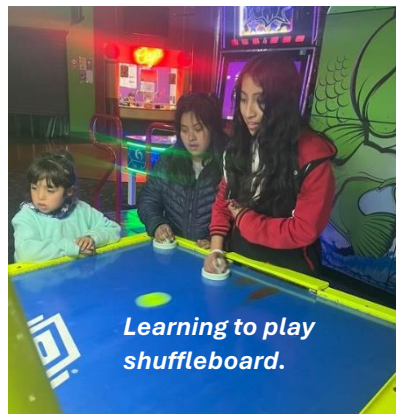
Learning to play shuffleboard.