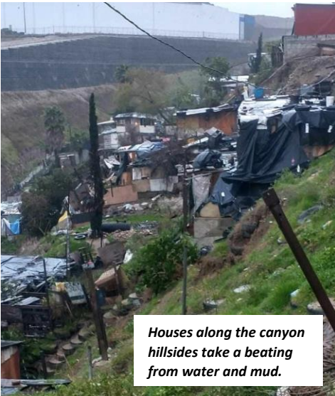
Houses along the canyon hillsides take a beating from water and mud.