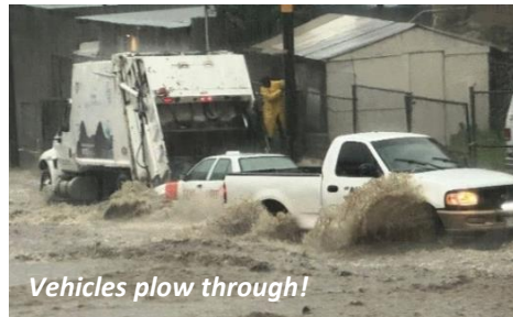
Vehicles plow through!