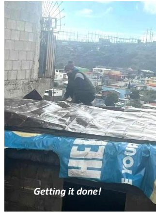
Getting it done!