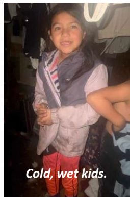
Cold, wet kids.