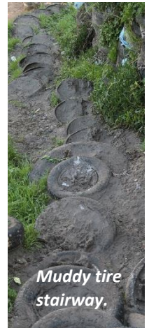
Muddy tire stairway.