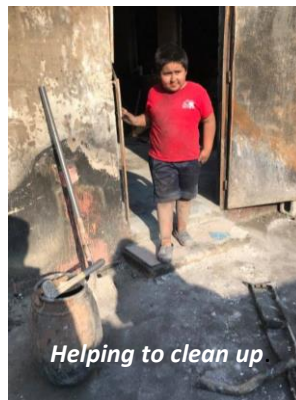
Helping to clean up