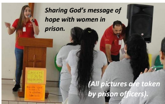
Sharing God's message of hope with women in prison.