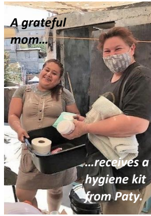
A grateful mom...