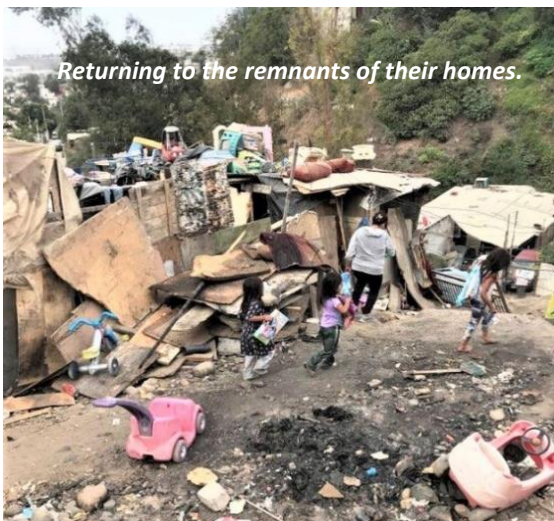
Returning to the remnants of their homes.