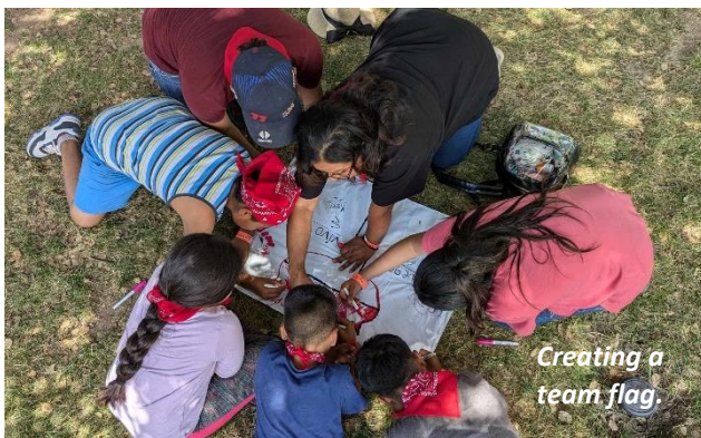
Creating a team flag.