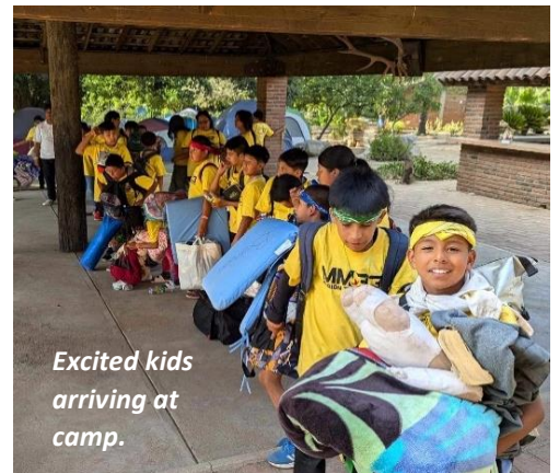
Excited kids arriving at camp.

Plan a trip down with us to be a part of this amazing project that God is doing!!