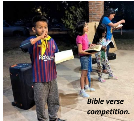
Bible verse competition.