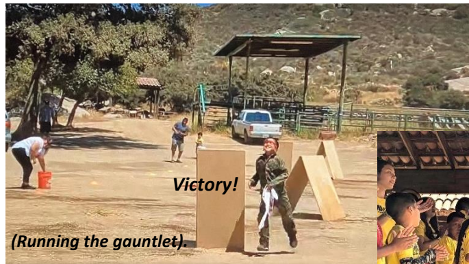
Victory! (Running the gauntlet).