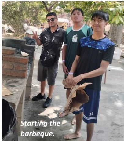
Starting the barbeque.