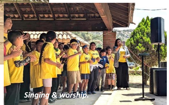
Singing & worship.

For we are His workmanship, created in Christ Jesus for good works, which God prepared beforehand that we should walk in them. Eph.2:10