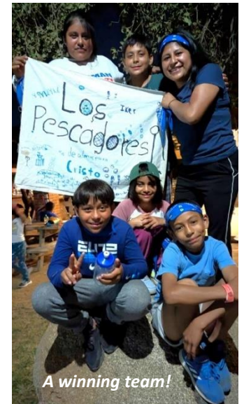
A winning team!