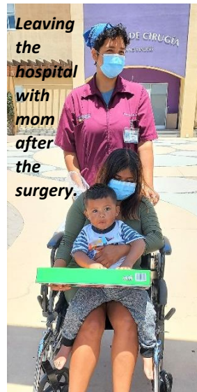
Leaving the hospital with mom after the surgery.