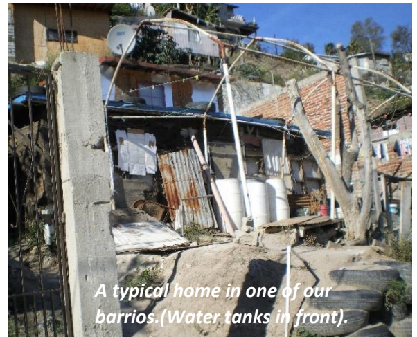
A typical home in one of our barrios. (Water tanks in front).