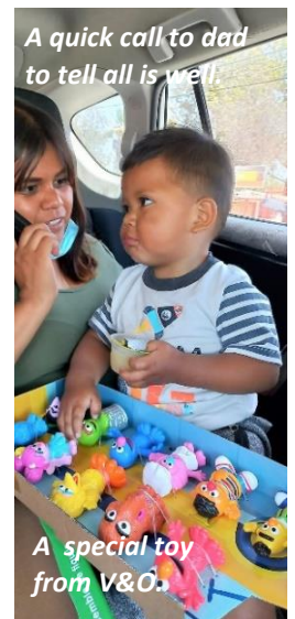
A quick call to dad to tell all is well.