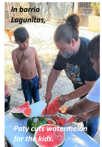
In barrio Lagunitas,