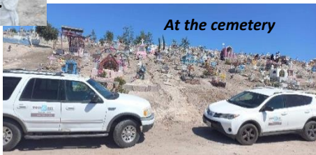
At the cemetery