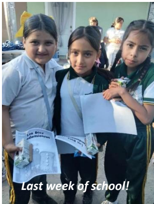
Last week of school!