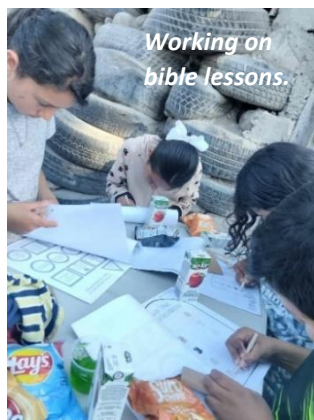
Working on bible lessons.