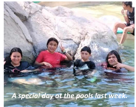
A special day at the pools last week.