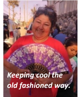
Keeping cool the old fashioned way.

Its official, summer is here!... and confirmed by the mid-90% temps this week! Schools are almost all out and parents in our barrios are preparing for the challenge of kids being home over the next couple of hot months. Most of these kids will spend the break playing in the dusty streets and canyons surrounding their homes. This time of year, especially, we look for ways to provide a brief respite and some fun summer activities, taking fruit, frozen treats, cool drinks, games and short devotional lessons along on our visits to the barrios. At times we're also able to take a few kids to the pools for the day, (some for whom it's often a first experience!)