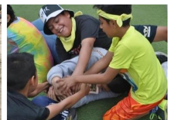
Above & below: Kids enjoying last year's camp.

If you'd like to sponsor a kid for camp, please write "Kids Camp" on any checks sent to V&O or go directly to www.operationworth.com to make a donation online. Thank you! (The cost for 1 child is $60, however any amount is much appreciated!)