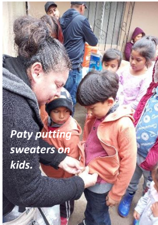
Paty putting sweaters on kids.