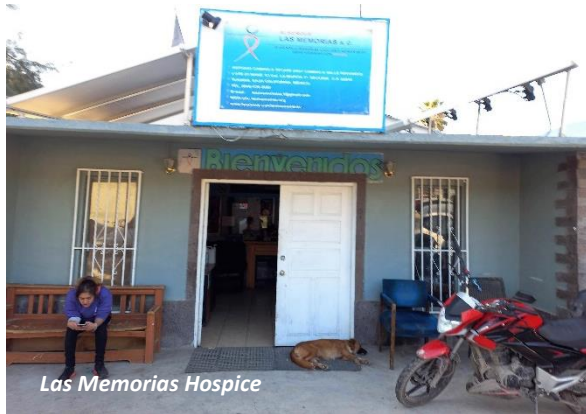
Las Memorias Hospice

Below: The kids at Las Memorias (AIDS Hospice) are always happy to see us. They live on site at the hospice with parents who are terminally ill. Being at the far end of town they don't often get visitors. We bring supplies for the hospice plus treats and a Bible lesson for the kids.