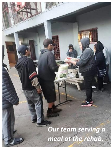
Our team serving a meal at the rehab.