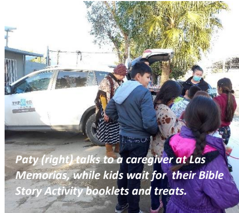
Paty (right) talks to a caregiver at Las Memorias, while kids wait for their Bible Story Activity booklets and treats.