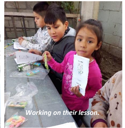
Working on their lesson.