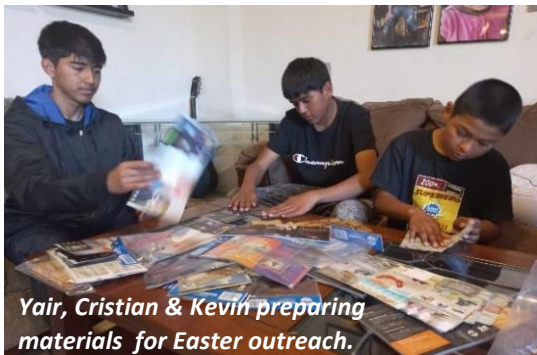
Keeping kids busy during school break!