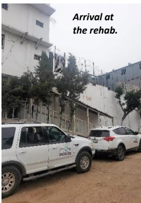
Arrival at the rehab.