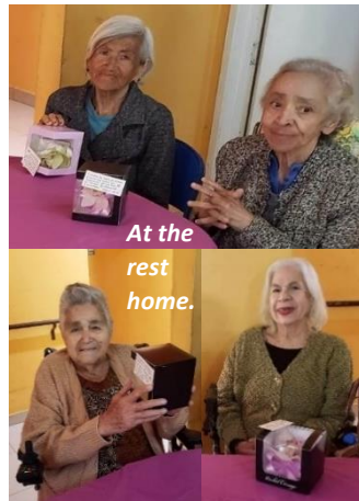
At the rest home.