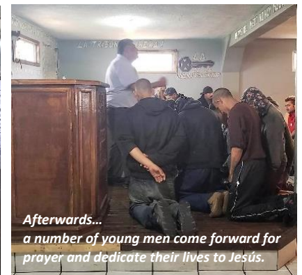
Afterwards... a number of young men come forward for prayer and dedicate their lives to Jesús.