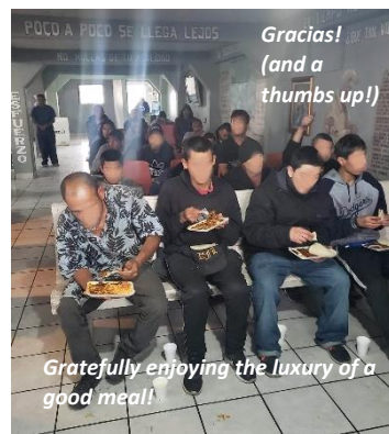
Gracias! (and a thumbs up!)