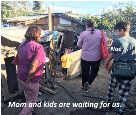
Mom and kids are waiting for us.