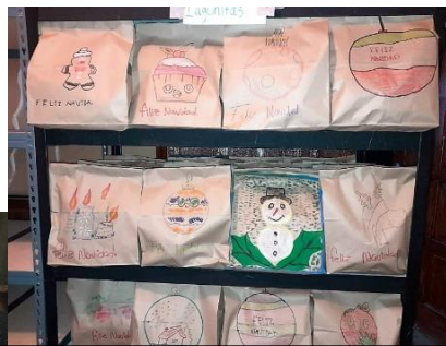
Above: The kids at Esperanza & Casa De Mi Familia Orphanages have been decorating the grocery bags for us.