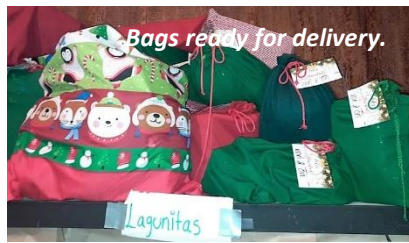
Bags ready for delivery.