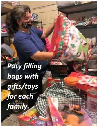
Paty filling bags with gifts/toys for each family.