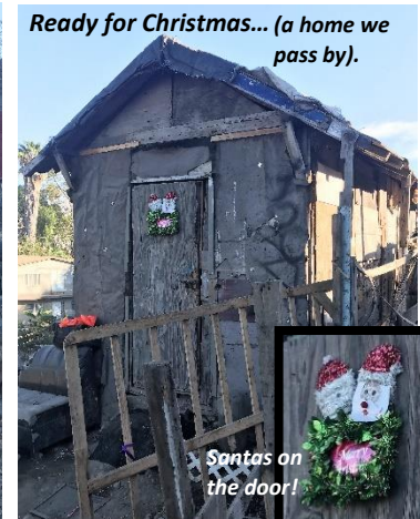
Ready for Christmas... (a home we pass by).