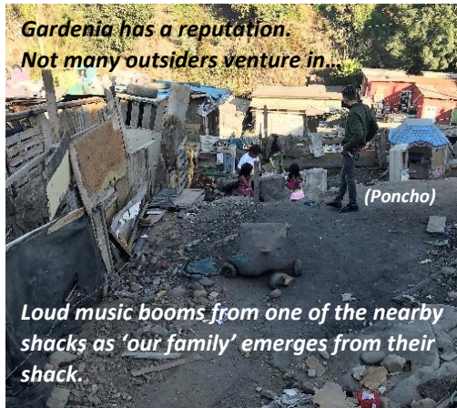
Gardenia has a reputation. Not many outsiders venture in...