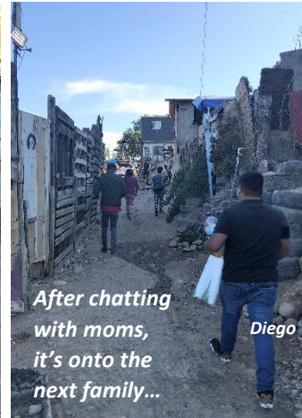
After chatting with moms, it's onto the next family...