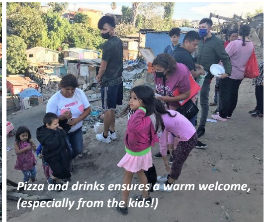
Pizza and drinks ensures a warm welcome, (especially from the kids!)