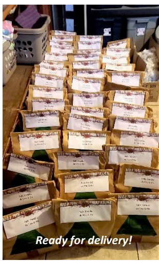
Ready for delivery!

An overall team effort requiring some careful budgeting and balancing of the finances! Although we're not quite there yet as far as the buying goes, we've been able to find some great deals in MX this year, which has helped stretch $ further. We plan to continue delivering gifts through into January, so any funds for Christmas sent by then, will still be most helpful and appreciated!