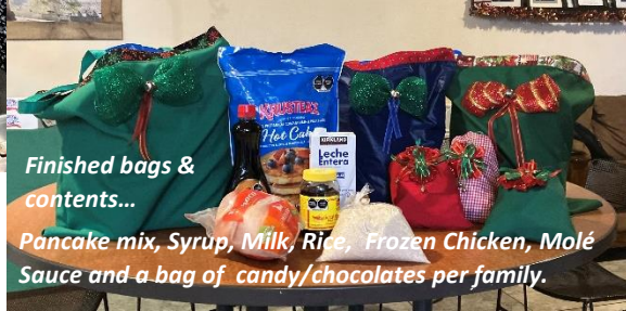
Finished bags & contents... Pancake mix, Syrup, Milk, Rice, Frozen Chicken, Molé Sauce and a bag of candy/chocolates per family.

This year price increases have been noticeable on all items; however Hortencia and the team have done a great job starting early to find good deals on the TJ side, enabling us to provide a generous food package for each family to enjoy a special Christmas meal, costing under $25.