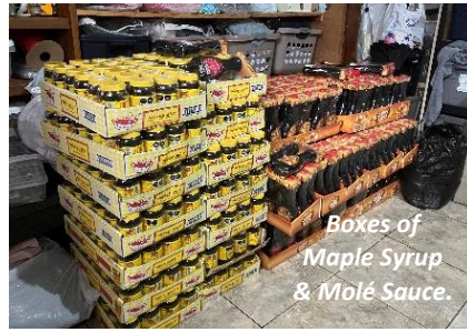
Boxes of Maple Syrup & Molé Sauce.