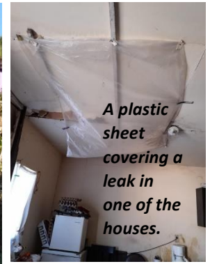
A plastic sheet covering a leak in one of the houses.