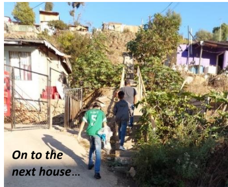
On to the next house...