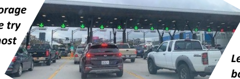
Left: Crossing the border into Mexico.

Space is a premium in our storage container and vehicles, so we try to stick to a specific list of 'most needed' items we transfer across to Mexico.