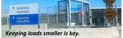
Keeping loads smaller is key.

MX Secondary inspection & Vehicle Xray... an area we try to avoid! Costs time and $.