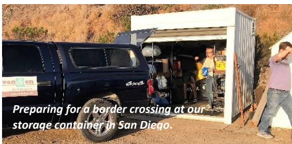
Preparing for a border crossing at our storage container in San Diego.

Transferring goods across the border these days is a little different than it used to be years ago, a lot more high-tech scrutiny, (both sides), but Jay was quick to