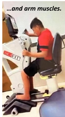
...and arm muscles.