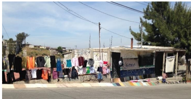
Selling goods outside homes and in street stalls/markets is a common way to make a living for many in our communities.