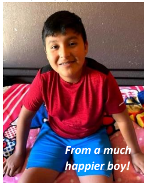
From a much happier boy!