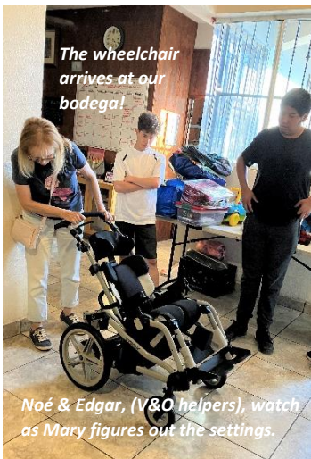
The wheelchair arrives at our bodega!