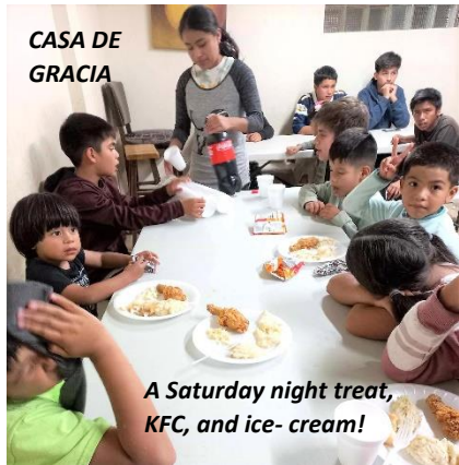
CASA DE GRACIA

ORPHANGE VISITS... Amid the variety of ministry work, regular visits to our orphanages remain a priority. The kids really look forward to them, as do we! May we THANK YOU again for helping to make a difference in the lives of these neat kids!