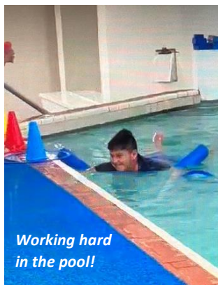
Working hard in the pool!