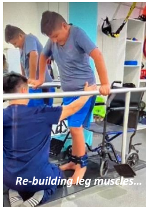
Re-building leg muscles...