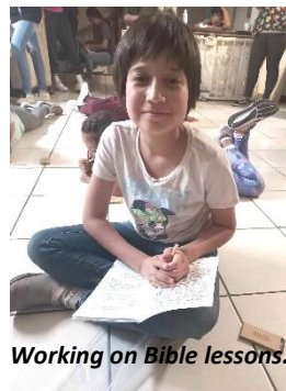
Working on Bible lessons.