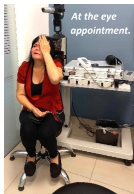
At the eye appointment.