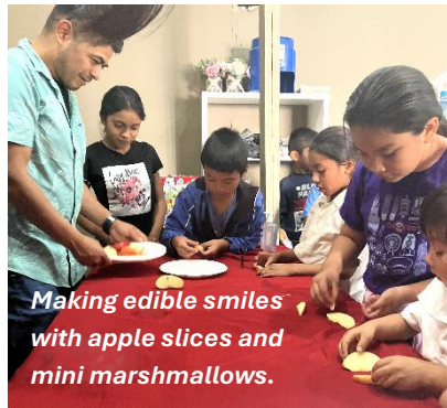
Making edible smiles with apple slices and mini marshmallows.