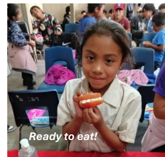
Ready to eat!