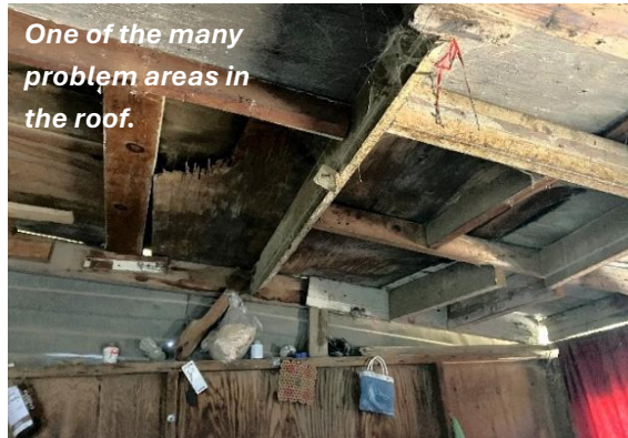
One of the many problem areas in the roof.