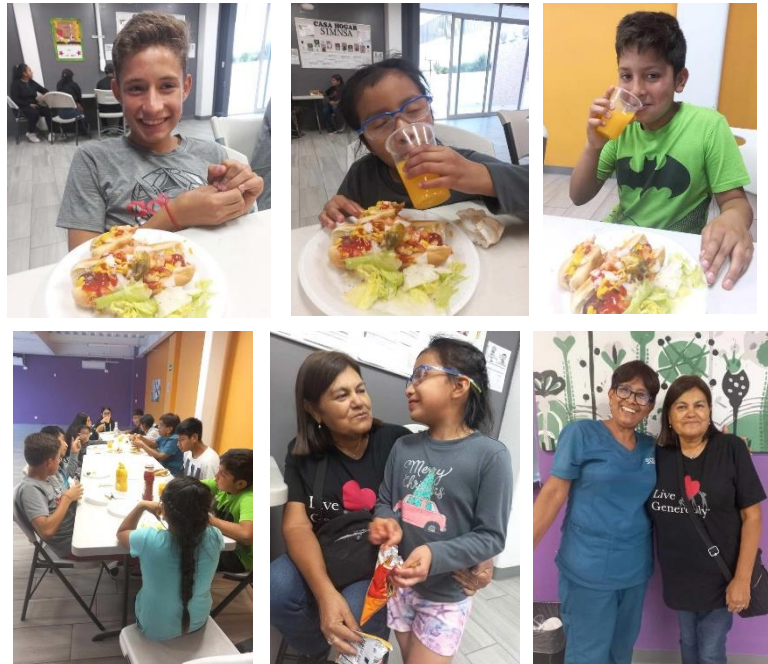
...The kids and staff at SIMNSA Children's Home (above), for the visits, special meal and groceries they receive and look forward to each month...