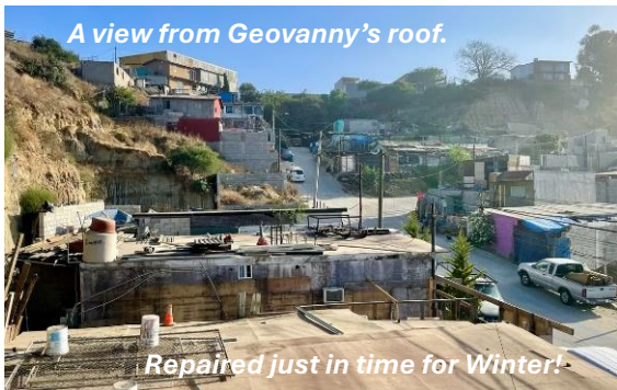
A view from Geovanny’s roof.