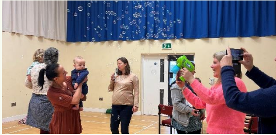
The team visited a local authority run stay and play group

Our aim was to gather intelligence from pregnant people, their families and professionals about island life with the view to making recommendations where appropriate.