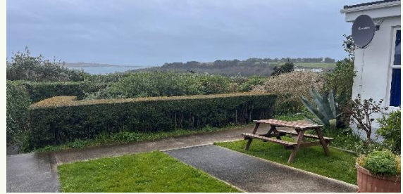
Visit the Community Hospital and Birth Centre.