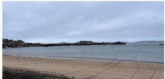
Understand the impact of living remotely on an island.