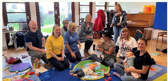
KMVP Celebration Lunch, open to all professionals and families.