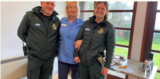
KMVP Isles of Scilly Conference was open to all medical staff on the island.