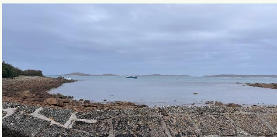
Share and learn across multiple agencies, service users and staff to enable us to influence change where needed.