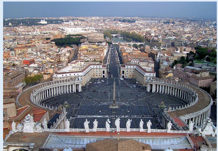
St. Peter's Square