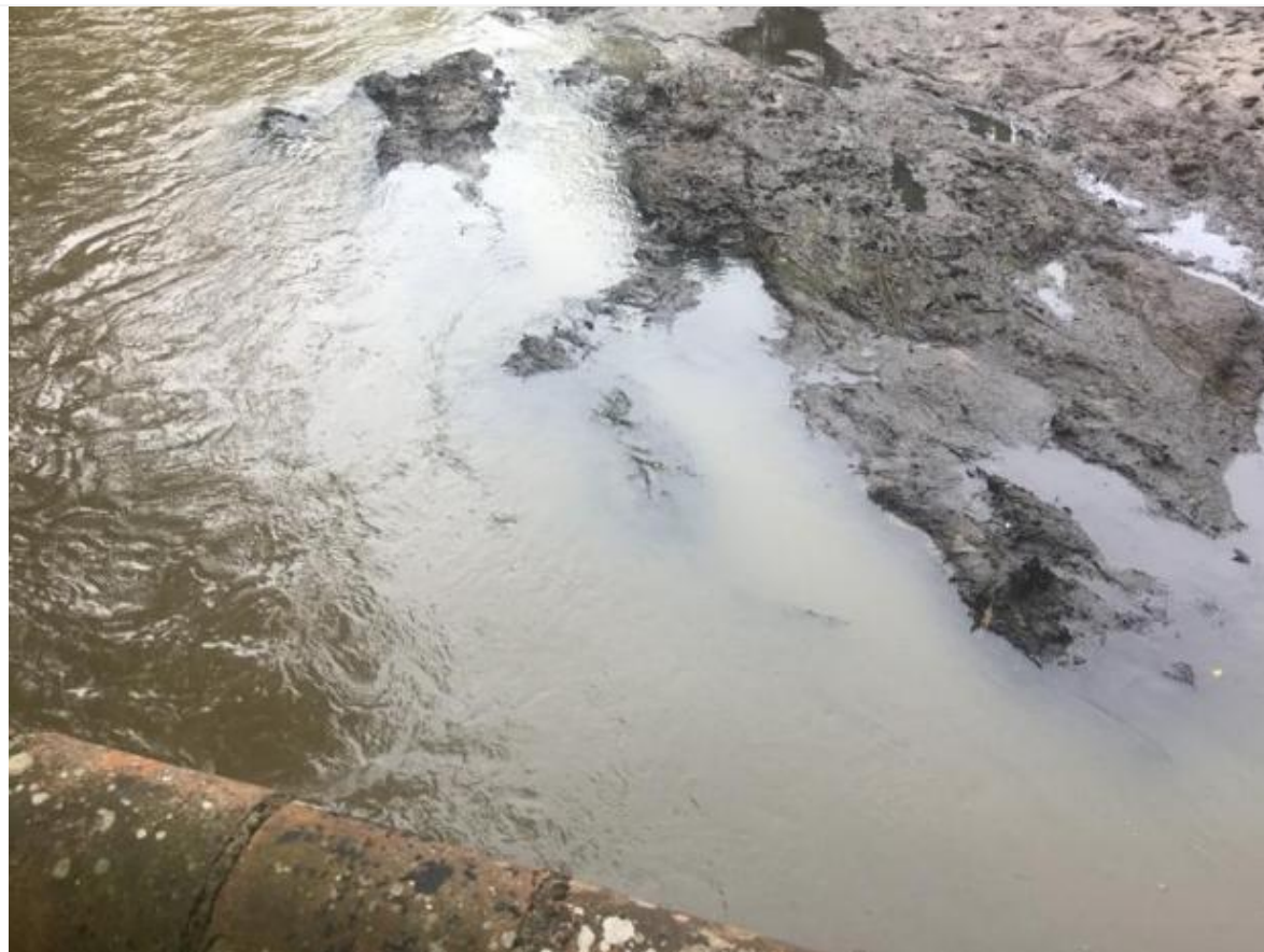
A section of the River Glaven - now narrower with more sediment