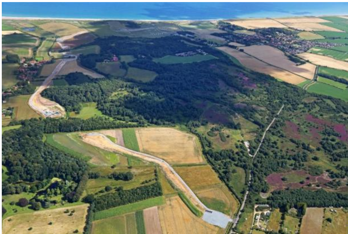
A view of the Hornsea Three trench being dug, showing Kelling Heath, the village of Weybourne beyond it, and the north Norfolk coast

READ MORE: Ørsted has started building trench for Hornsea Three wind farm