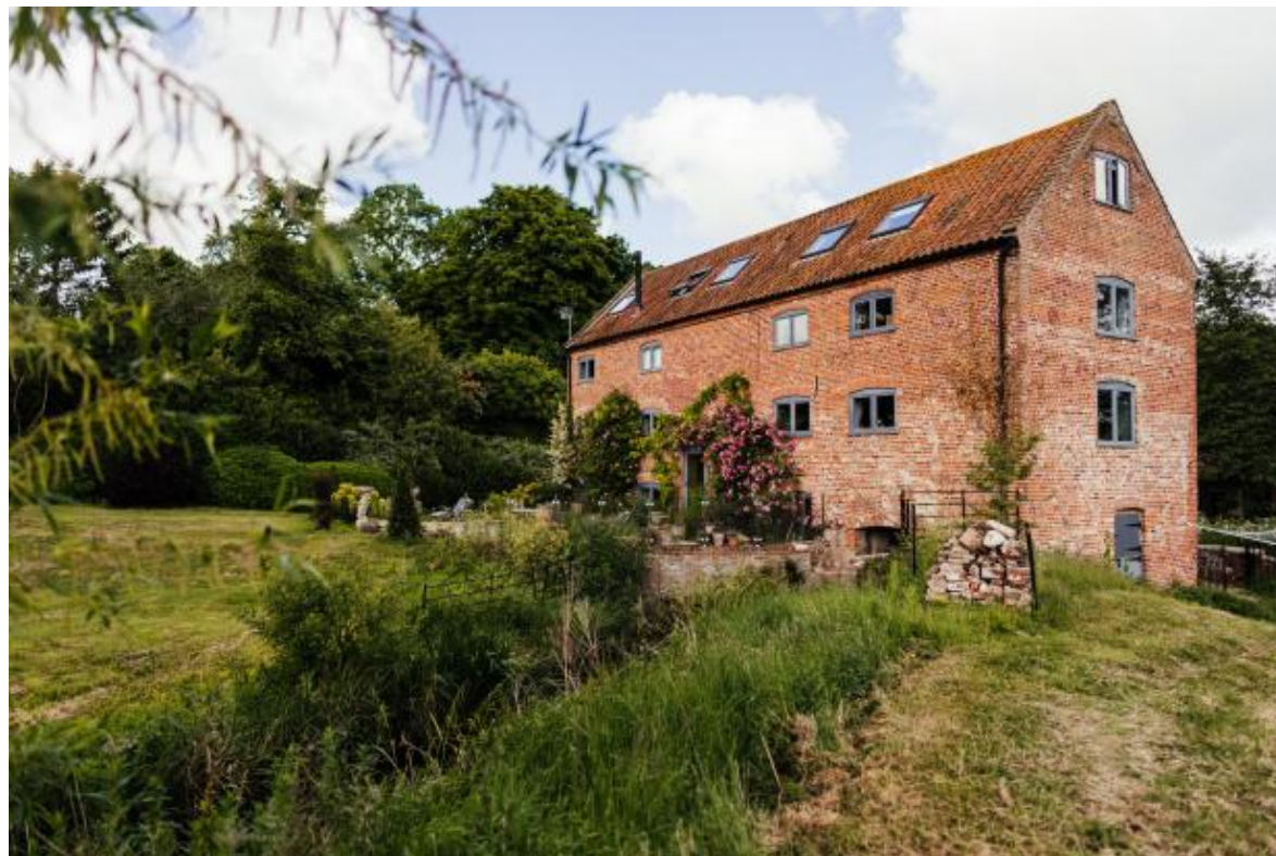
Thornage Watermill

“We told them and they chose to ignore it.”