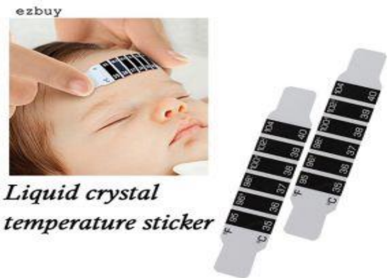
Liquid crystal temperature sticker