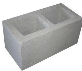
8x8x16 Cinder Blocks