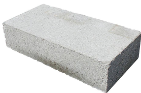
4x8x16 Solid Concrete Pads