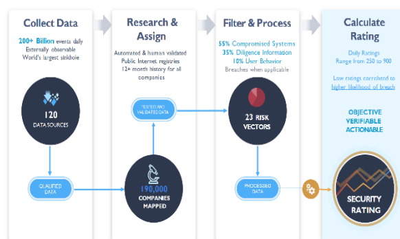
Figure (2): Ranking Process