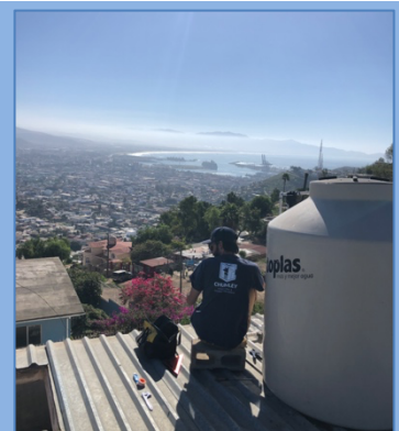
Updating the plumbing of our water reservoir

We also might be receiving three new Deaf men at the start of the new year into the program. We pray that everyone at Casa Josué receive a deeper revelation of God's love for them.