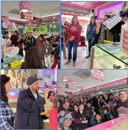
Highlights from our Shoe Day event with LifeBridge Church

Shoe Day was more than an event: it was a beautiful expression of the Body of Christ coming together to serve, love, and uplift the Deaf community in Ensenada.