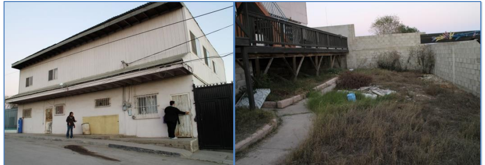
Besides fixing up the backyard, other projects include remodeling the kitchen, living room, and all bathrooms on the top & bottom floor. Pictured above is the front of ESM and the backyard. For more info, go to our website www.wbfglobal.org

have been recently praying for volunteers and church groups to come and help in repairing the house, and it looks like we will be receiving a church group in the winter to help us with ESM repairs. Praise God!